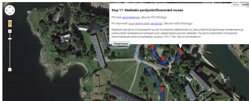
Fig. 1. Suomenlinna Blue Route represented with TourRDF, with a tour stop selected.

sources can be combined to enrich and add more content to tours, not to act as an actual mobile guide. The example tour shown on the Figure 1 is the main tourist route in Suomenlinna, the Blue Route. 5 The tour consists of 42 stops, and each stop consists of one Suomenlinna building (POI). When a map marker is clicked, an info window with a short description, POI type, and keywords (if available) pops out. The Read more button there generates a stop info page with links to additional contextual background data. The background data is generated by SPARQL queries to several datasets published in the LDF data service, such as the Finnish History Ontology, Semantic National Biography, and MuseumFinland collections of artifacts.